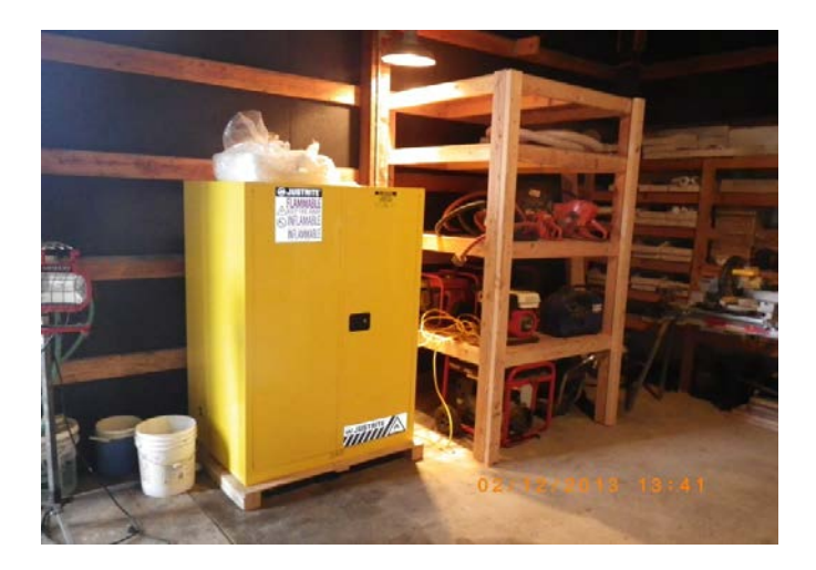
Picture of the new flammable locker & some of the new shelves in the shop.