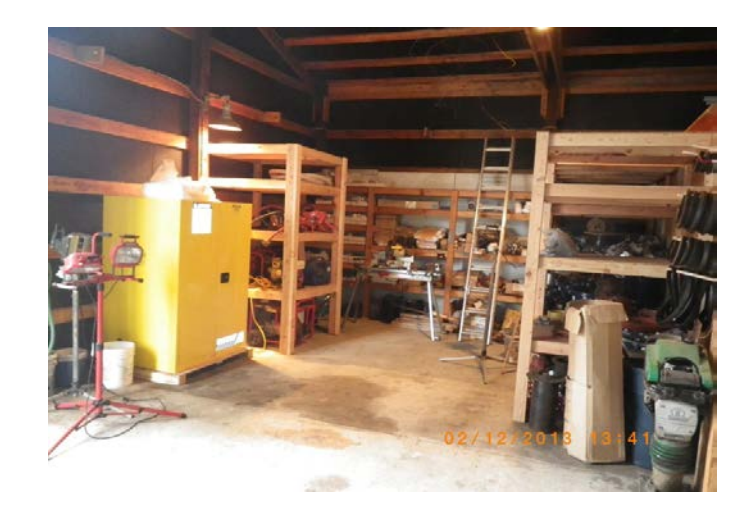
Another picture of the new shelves at the shop.