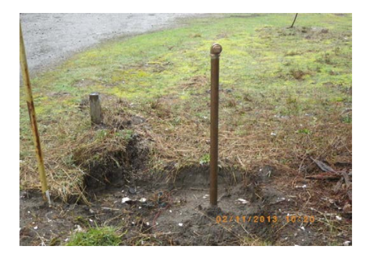
New blow off we installed at the South end of K Pl off 225th.