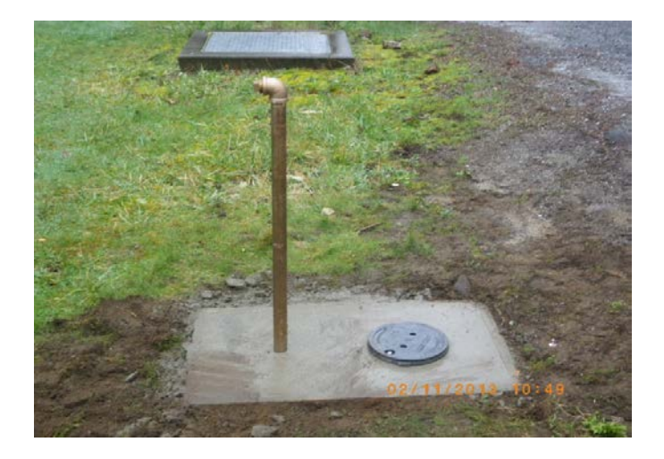
New blow off installed with the concrete poured.