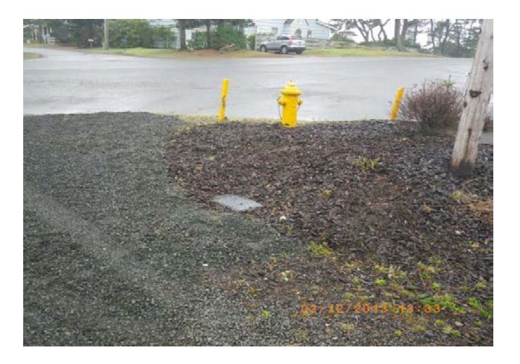
Another picture of the Pilot House's meter.

After we replaced the service line & the angle meter stop for the Pilot House.