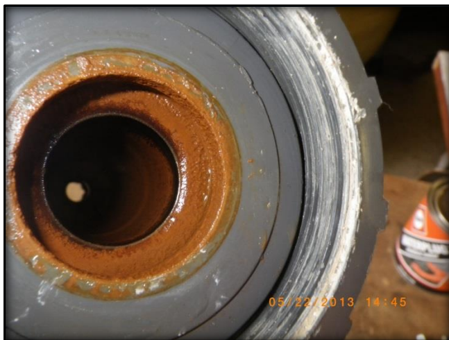
Picture of the iron inside the Mozzi. The Mozzi is what creates a vacuum so we can release ozone into our water.