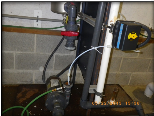
Picture of where the Mozzi is usually located.