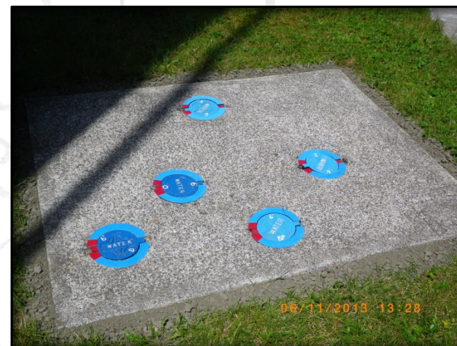
Another valve slab after the lids was repainted.