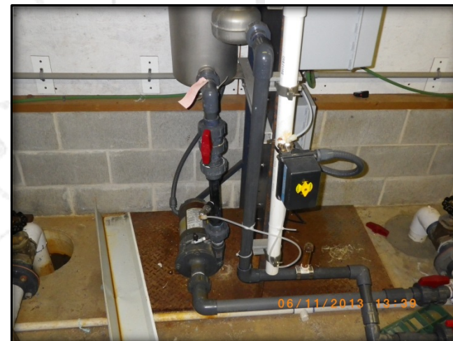
Picture with the Mozzi now in place.