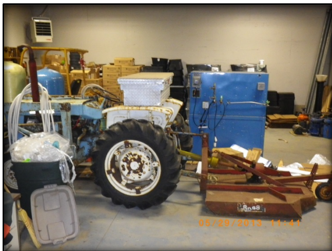
Picture of before we cleaned up and organized the stuff at the SWF.