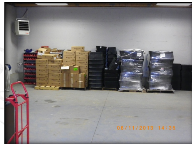
Picture of after we cleaned up and organized the stuff at the SWF.