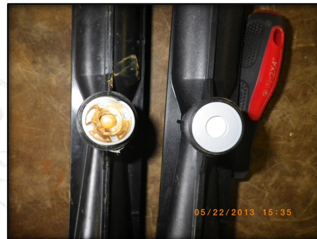
Another Picture of the Mozzi , this time you can compare the difference between the old parts and the new parts