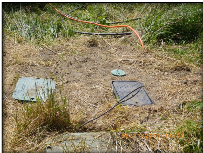
Meter box on the right is one of the new services we installed.