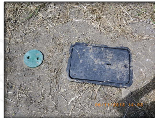
Another picture up close of the new service we installed.