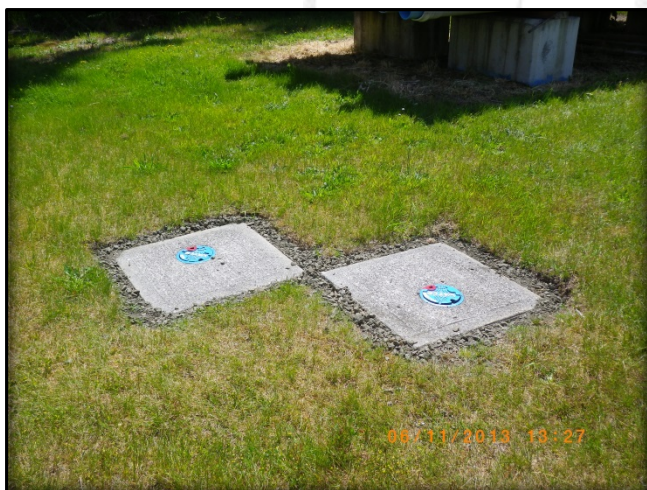
Picture of the valve slabs touched up.