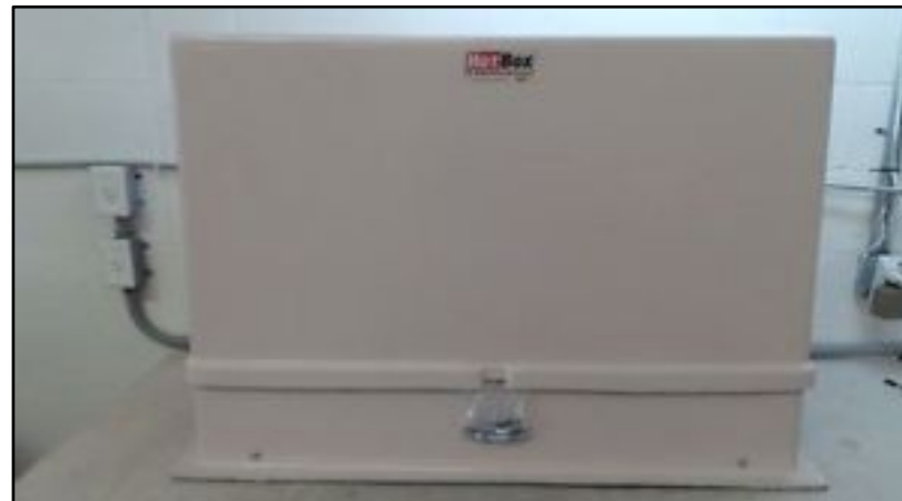
An insulated enclosure for a 1.5" or 2" RPBA