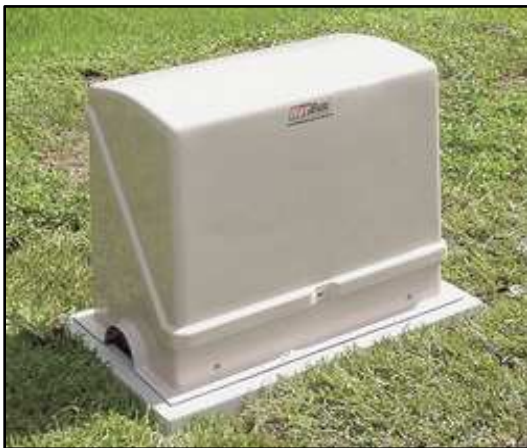
An insulated enclosure for a 3/4" or 1" RPBA