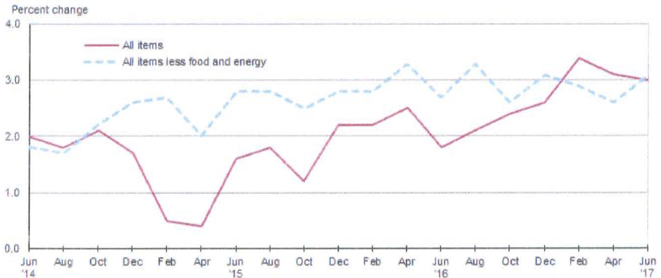
Chart 1. Over-the-year percent change in CPI-U, Seattle, June 2014–June 2017